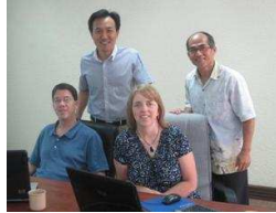
D.Min. Project Design APTS, Philippines