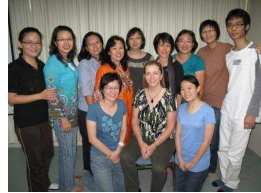
ATCEM Class Kuching, Malaysia