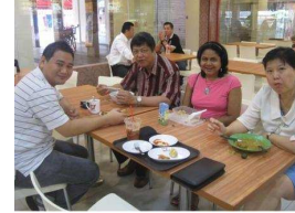
ATCEM students Singapore