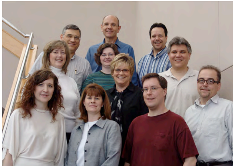
AGTS Alums on the Homefront

In this issue, we want to connect you to 22 alums who serve at AGTS in addition to their other ministry responsibilities. They represent graduating classes from the 1970's through 2007. We managed to catch about half of them in the picture below. Do you recognize some faces and names? We hope you enjoy reading about a few who think outside the box when it comes to ministry.