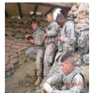
Conducting a service at a patrol base for soldiers.

They are not like home by any stretch of imagination, but are sufficient and provide all the basic necessities: hot showers, hot chow, laundry services, and availability to call or e-mail home. We are now postured to help secure the Afghan population and assist the civil political leaders increase infrastructure capacity, and provide a better future for the Afghan citizens through various aid programs and jobs.