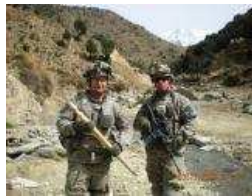
Visiting soldiers in Pakistan.