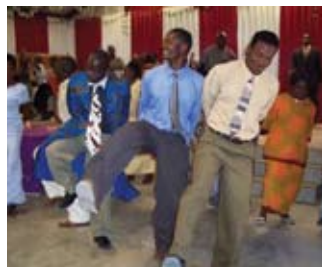
Students at AG Bible College in Tanzania